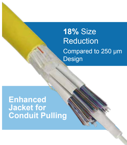
AccuTube 200 µm Rollable Ribbon Indoor/Outdoor Building Cable

Ultra-High Density Building Cable Offers a Compact, Flexible Cable Design for Data Center Applications