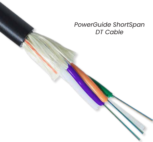
PowerGuide ShortSpan DT Cable

Totally Gel-Free, ADSS Cable Enables Faster and Less Costly Installation for FTTH and Power Network Deployments