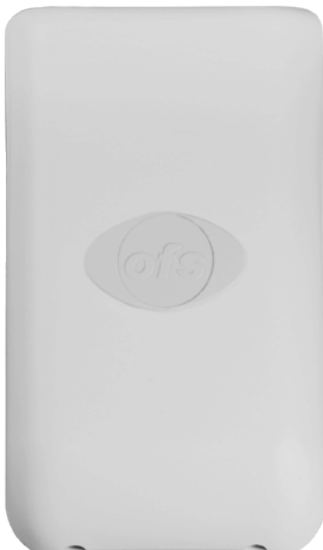
Wall Plate Cover